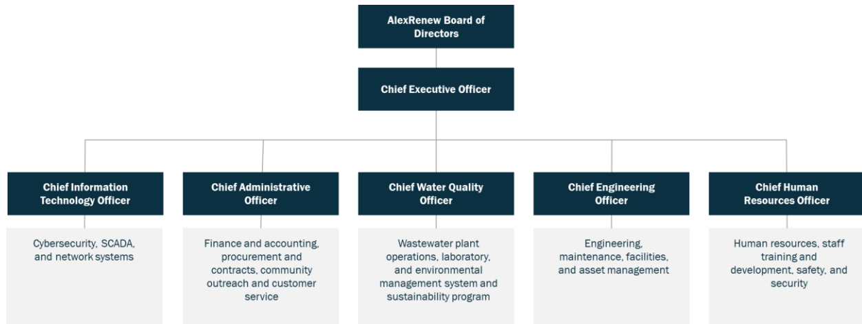
Figure 1.1. AlexRenew's Organizational Structure and Departmental Responsibilities