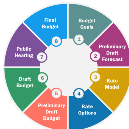
Figure 2.1. Annual Budget Cycle

AlexRenew uses a fiscal year cycle ending June 30. The FY2026 Operating and Capital Budget will encompass the 12-month period from July 1, 2025 – June 30, 2026. The budget is developed following the eight (8) steps identified in Figure 2.1.