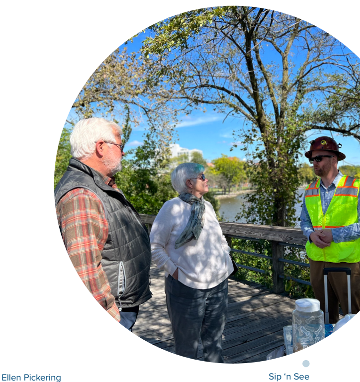
Sip 'n See