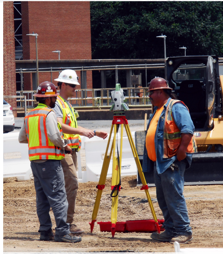
Crews conducting survey work in Alexandria

Scan to learn more about the Commonwealth Interceptor Upgrade Project!