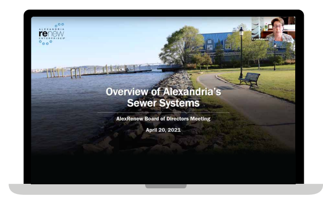
20+ virtual meetings hosted to discuss our work with the community

In 2021, the COVID-19 pandemic brought new challenges to communicating progress of ongoing work. By continuing and expanding our use of virtual channels, we kept our community up to date from a distance on how our team continued to forge ahead.