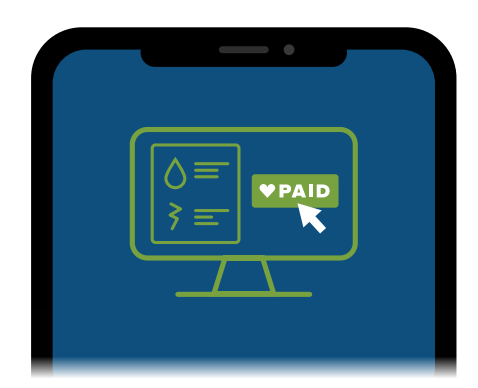
Partnered with Promise Pay to distribute bill relief grants from the state to customers impacted by COVID-19