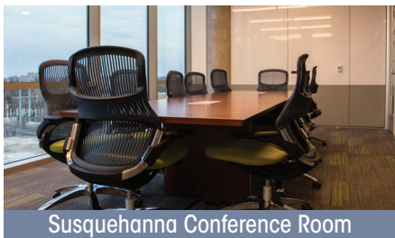
Susquehanna Conference Room