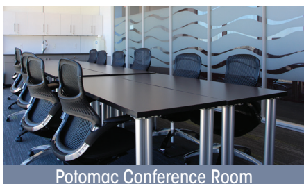
Potomac Conference Room